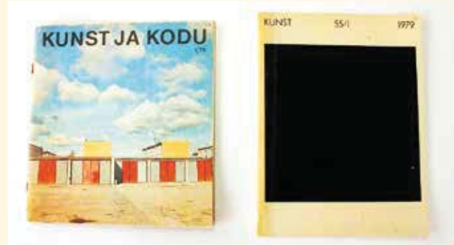
The covers of magazines ( Kunst, Kunst ja Kodu ) in which Lapin published depicted everyday modernist landscapes and contained references to avant-garde history.

SO WE SHOULD NOT overlook the way in which the objectives and accents in the experimental architecture of that time paralleled radical Western architecture that Estonians were aware of. The agenda of the role and autonomy of art in Estonian avant-garde art (or architecture in this case), which Lapin also allows to resonate in his 1970s writings, was just as salient in the postwar critical architecture of the West, which was concerned with defining the role of the architect and the possibilities, not the bare actualities, of architecture; hence the obsessive search for architecture's fundamental codes and principles. 40 The difference was a matter of accent: instead of “machine” and “space”, the West was concerned with “typology” and “form”. The question of realism in 1970s architecture that retained a fundamental contradiction between autonomous aesthetic production and representation of reality also added further complications. While realism in painting or cinema, means very broadly, the similarity between the image and what it represents, the forms of architecture represent visibly, most fundamentally, architecture itself. Or, as K. Michael Hays has put it: “The real represented by architectural realism is a real that architecture itself has produced”. 41 Yet just as, according to Hays, the commitment to the rigorous