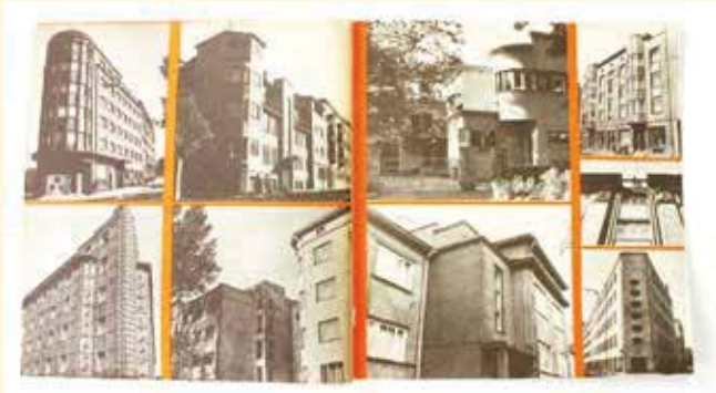
Lapin used visual narrative to write history. A photo page from the magazine Kunst ja Kodu .

chitects had gained rather good access to foreign architectural magazines via the library of the Academy of Sciences in Tallinn. Lapin's, Künnapu's, and others' texts reflect their familiarity with writings and activities by Robert Venturi, Charles Moore, Robert Stern, and the New York Five, without much delay. The number of foreign books that were translated and published in the Stroizdat publishing house in Moscow show that architects and scholars in the Soviet Union did not live in a vacuum – quite an extensive list of books on Western modern and contemporary architecture was published, including works by Sigfried Giedion, Nikolaus Pevsner and Reyner Banham, and accounts by Soviet authors even on experimental architecture in the Western countries during the 1960s and 1970s. 39 One might say that Estonian artists and architects were familiar with the ideas of Western late modernism, although writing and discussions about them only appeared in the 1980s.