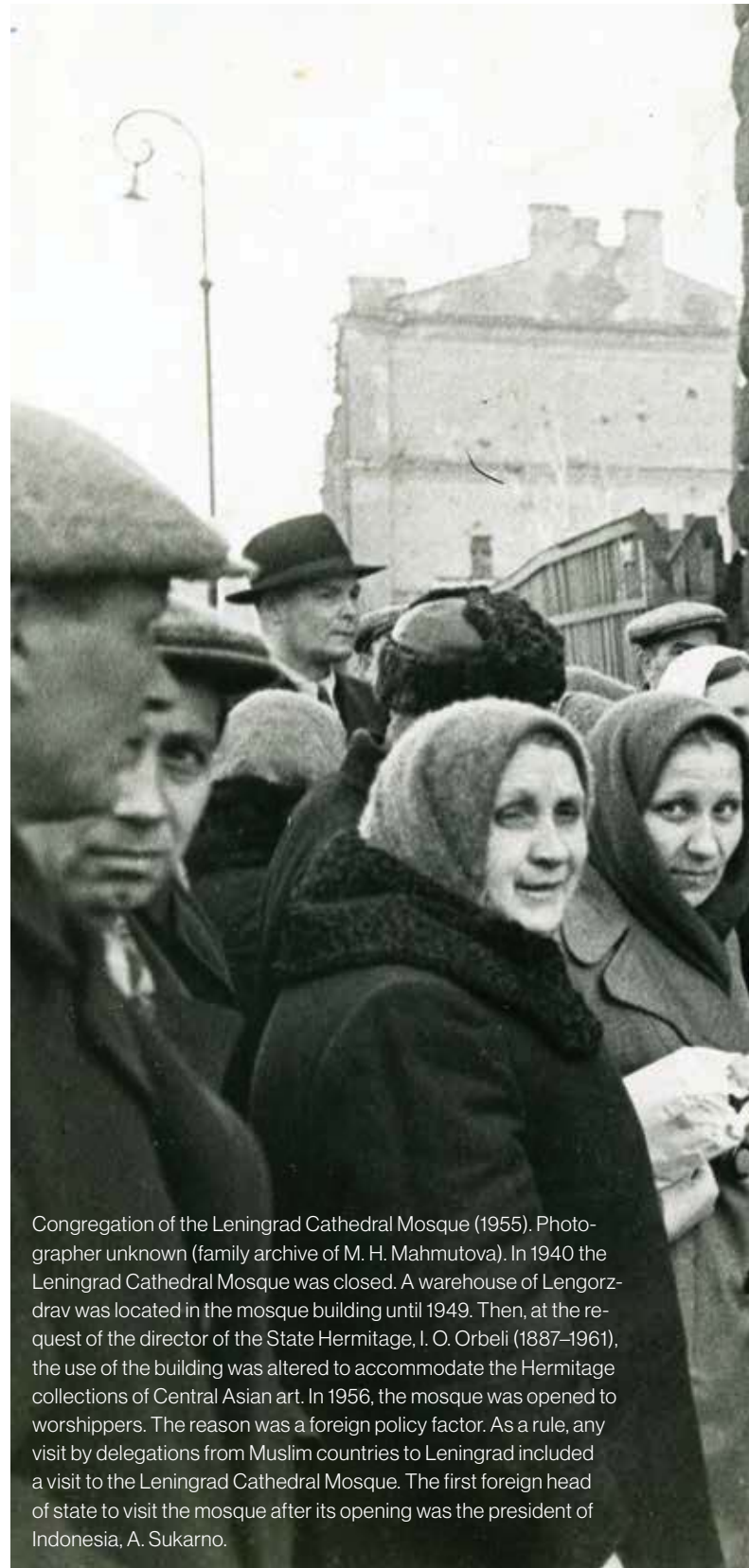
Congregation of the Leningrad Cathedral Mosque (1955). In 1940 the Leningrad Cathedral Mosque was closed. A warehouse of Lengorzdrav was located in the mosque building until 1949. Then, at the request of the director of the State Hermitage, I. O. Orbeli (1887–1961), the use of the building was altered to accommodate the Hermitage collections of Central Asian art. In 1956, the mosque was opened to worshippers. The reason was a foreign policy factor. As a rule, any visit by delegations from Muslim countries to Leningrad included a visit to the Leningrad Cathedral Mosque. The first foreign head of state to visit the mosque after its opening was the president of Indonesia, A. Sukarno.