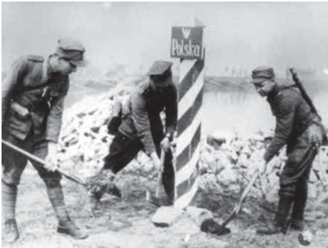
Marking the new Polish-German border on the Oder River in 1945.