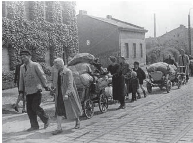
Refugees trail, eastern Germany 1945.