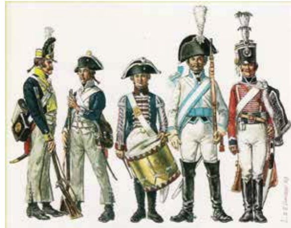
Prussian uniforms in the 19 th century.

several waves of settlement with different goals, the first beginning in 1747 in the Oderbruch wetlands but extending into Pomerania near Stettin, one in 1772 aimed at helping the large estates of Central and Eastern Pomerania with manpower, and another in 1780–1786 mainly consisting of small farmers. Szultka estimates the total number of settlers at 36,000, 70% of whom were immigrants to Prussia. 23