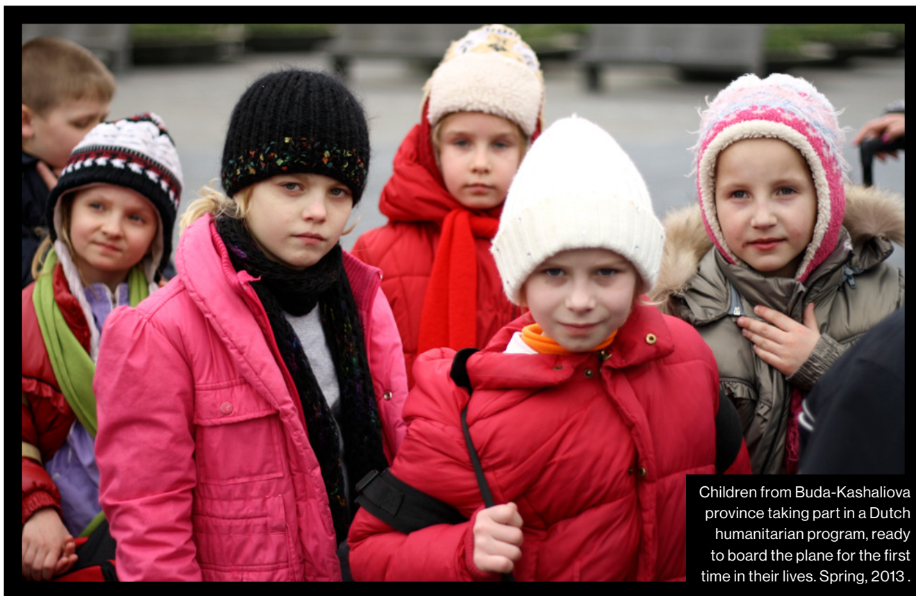
Children from Buda-Kashaliova province taking part in a Dutch humanitarian program, ready to board the plane for the first time in their lives. Spring, 2013.