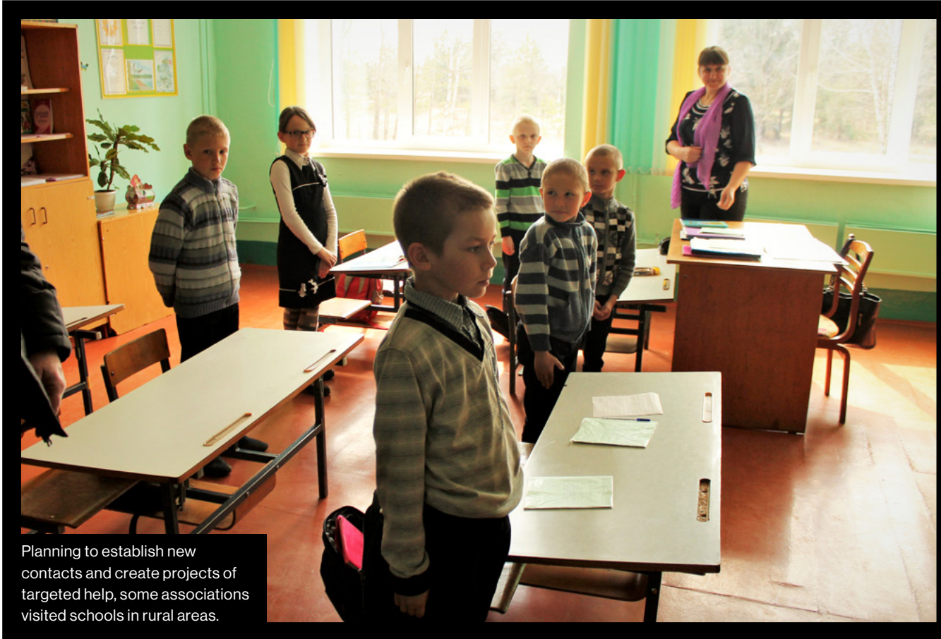
Planning to establish new contacts and create projects of targeted help, some associations visited schools in rural areas.