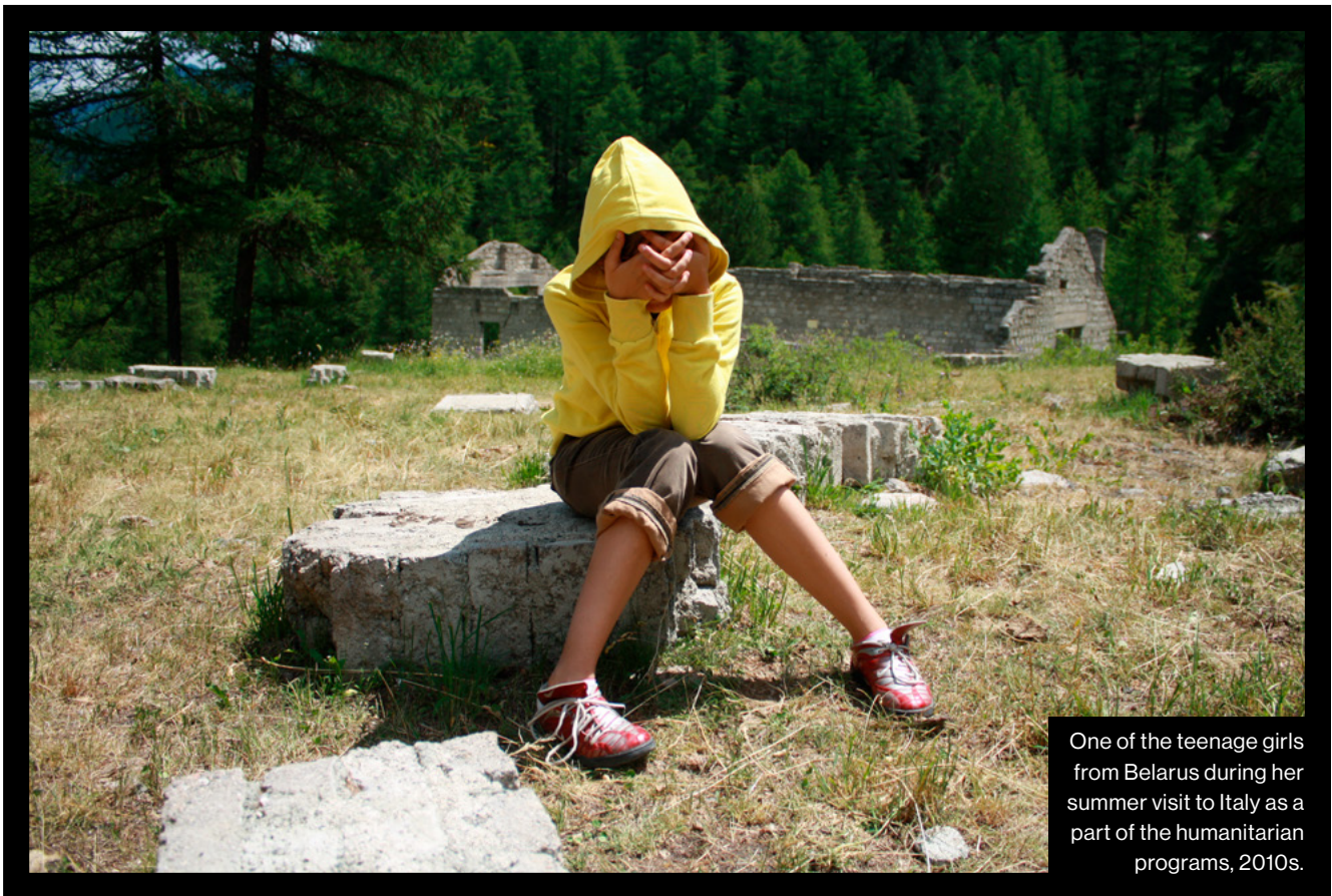
One of the teenage girls from Belarus during her summer visit to Italy as a part of the humanitarian programs, 2010s.